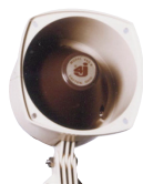
Extra Infinity speaker (INF-SP)