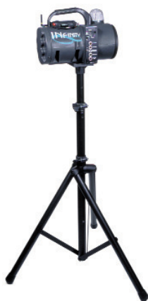
Infinity on tripod (INF-TR)